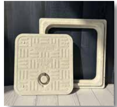
FRP (FIBRE REINFORCED PLASTIC)